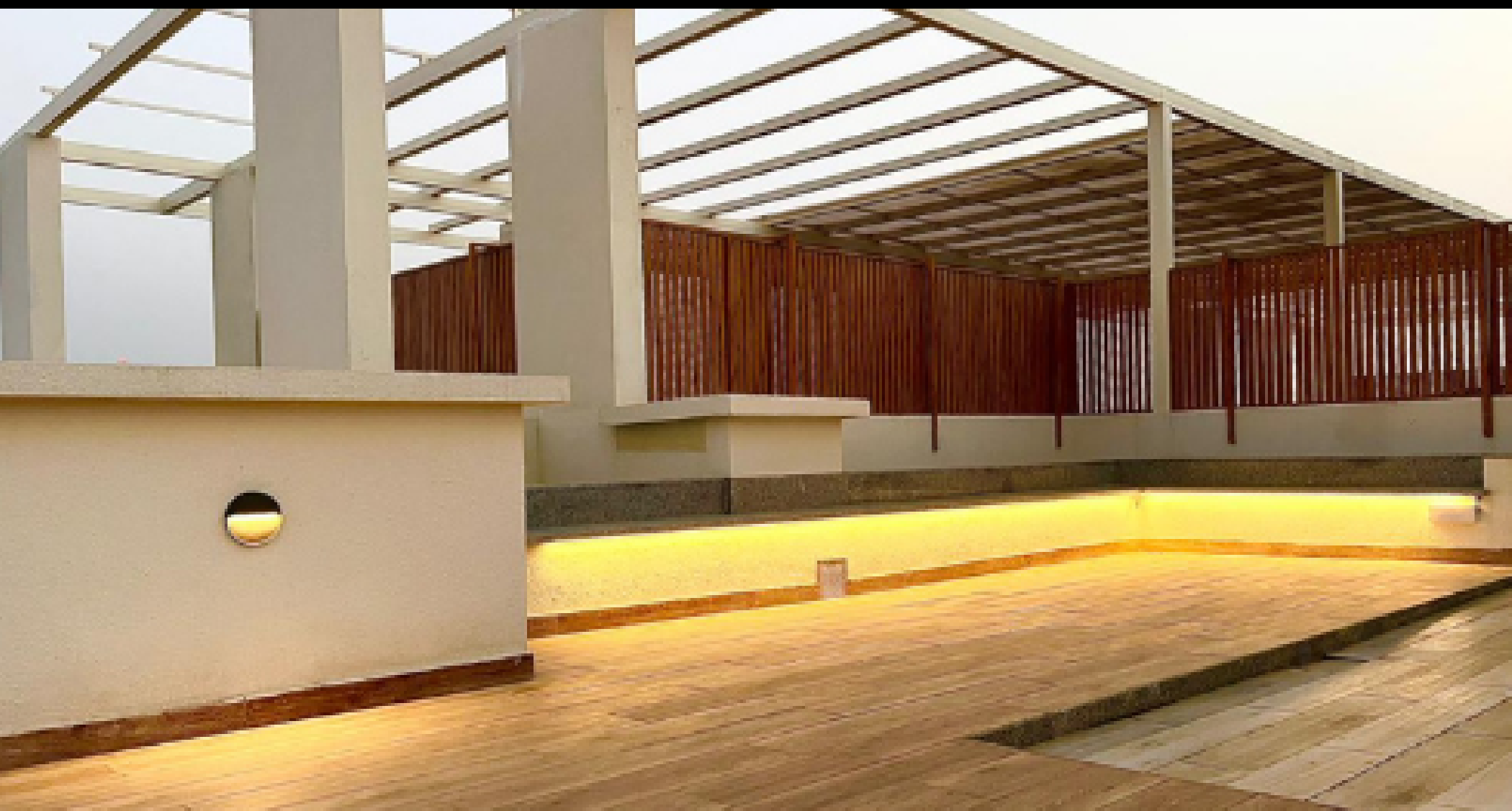
A TOWER 15TH FLOOR DECK